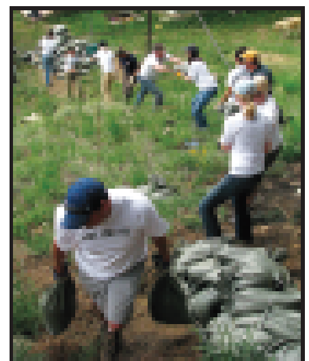
Community service project with volunteers and staff.

Volunteers are the backbone of our organization. They provide the hands and feet that make our services possible. From food bank volunteers to those who assist with our financial counseling, our volunteers are the heart of our organization. We are grateful for their dedication and commitment to our community.